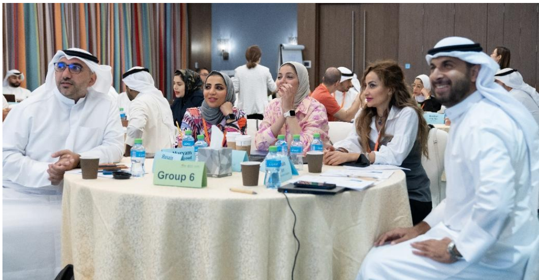
▲ KFAS executive participants engaging in dynamic classroom discussions.

Beyond degree programs, HKUST Business School has established itself as a leader in executive education for Belt and Road partner nations, delivering impact-driven training that addresses critical industry needs. Since 2018, the school has collaborated with the Kuwait Foundation for the Advancement of Sciences (KFAS) to upskill senior executives in the Middle East. In February 2025, 29 Kuwaiti executives attended a five-day Digital Leadership Program in Hong Kong, where professors guided them through digital management strategies, AI applications, data-driven decision-making, and customer experience transformation—equipping participants to navigate rapid technological change.