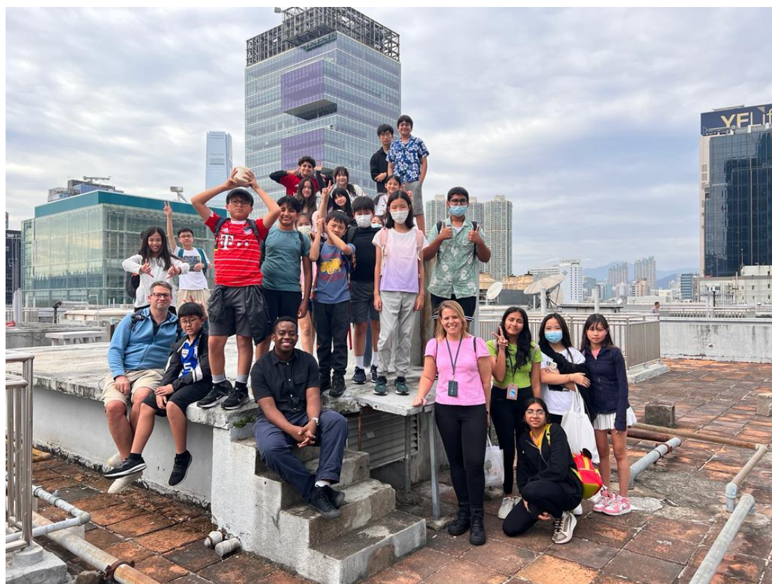
▲ Africa Center Hong Kong leading Chungking Mansions tours for young students.

Connecting the World from Hong Kong: 100 Belt and Road Stories