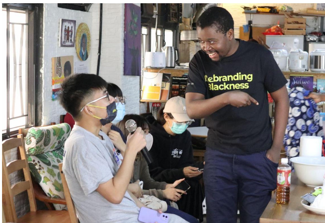
▲ Africa Center Hong Kong's events connecting African and Asian communities.