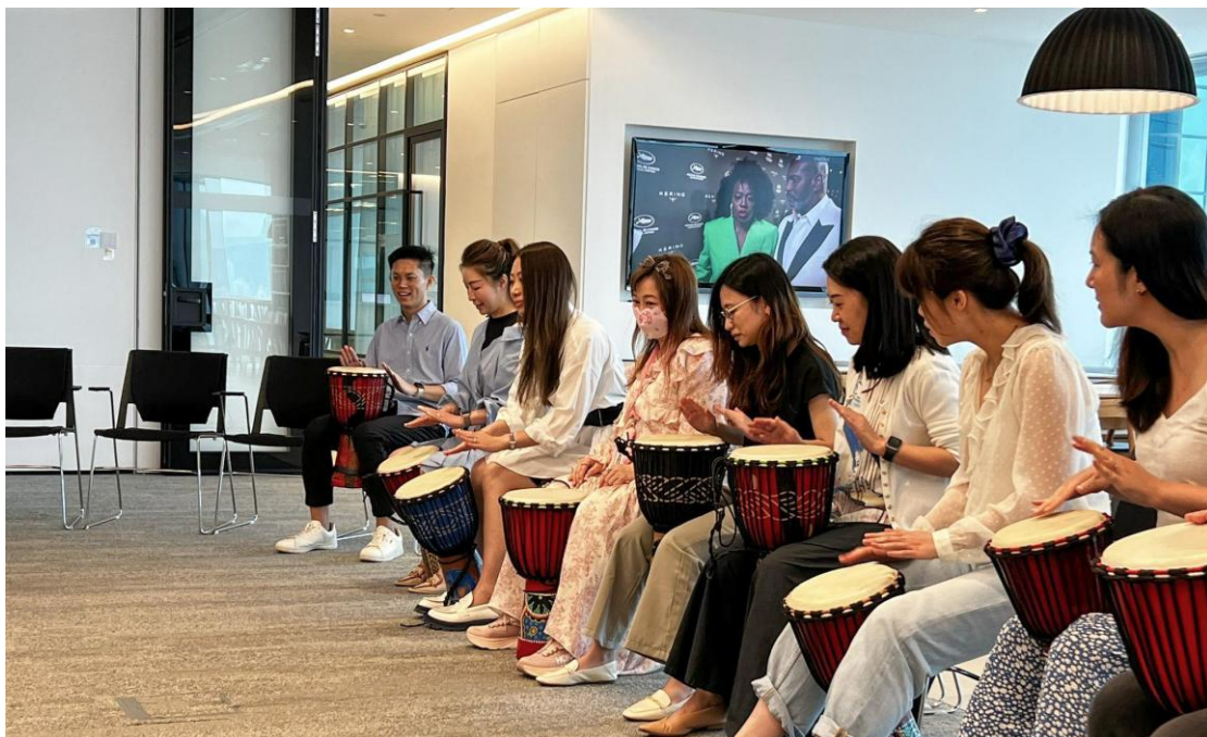
▲ African drumming workshop with corporates.